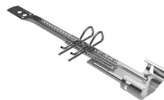
Complete NORGIPS suspended ceiling hanger: rotary hanger with vernier, nonius hanger, vernier pin